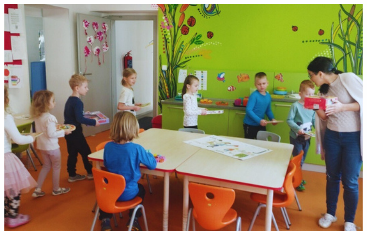
Serving a big fruit jelly cake is no easy task!