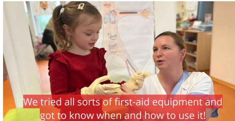
We tried all sorts of first-aid equipment and got to know when and how to use it!