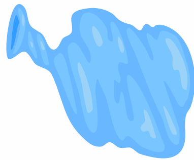
Fishes know what's the sound of deflation...!