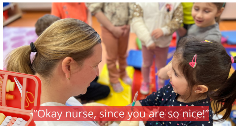
We learned how to take care of our bodies